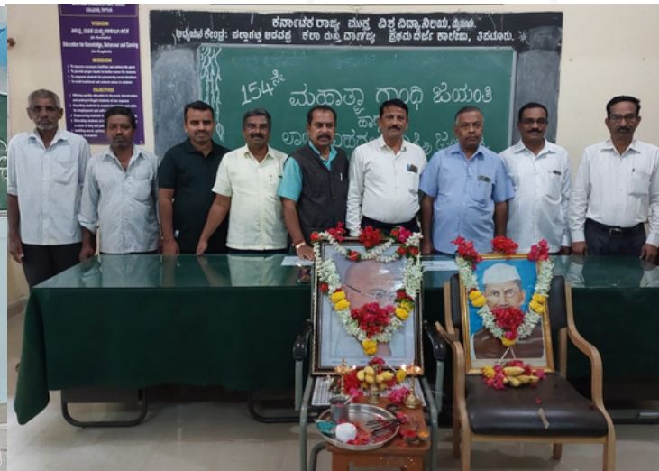
02-10- 22 : Sri Lal Bahadur Shastri and Mahatma Gandhiji's birthday was celebrated with patriotic fervour by all the staff and students with the Principal.