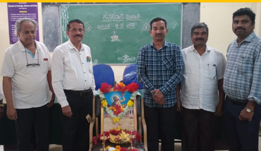
11- 11- '22: The birthday of the famous Haridasa saint and philosopher, Kanakadasa was celebrated as Kanaka Jayanthi, in our campus.