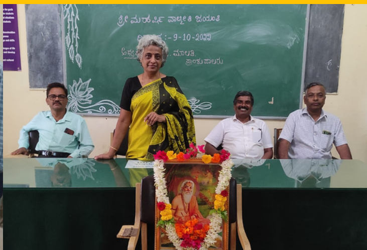
09- 10- 22 : The birthday of the ancient Indian poet and philosopher Valmiki, Maharshi was commemorated as Pragat Diwas